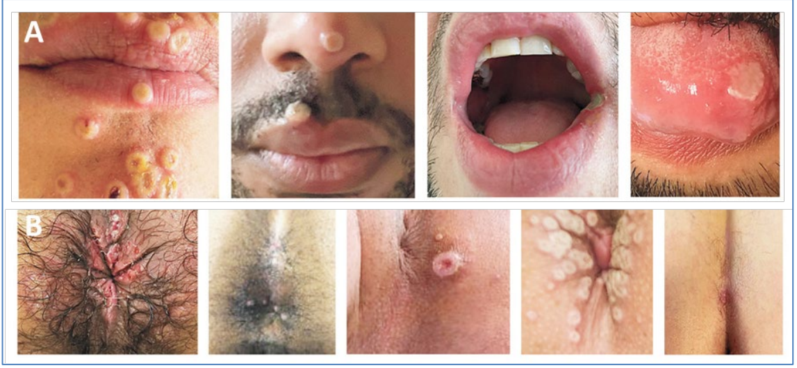
Figure 4 – Characteristics of the lesions and most affected anatomical sites in people infected with Mpox. Distribution and evolution of lesions in the oral cavity (A) and quantitative and evolution of anogenital lesions (B). Extracted from Thornhill JP et al.<sup>42</sup>.