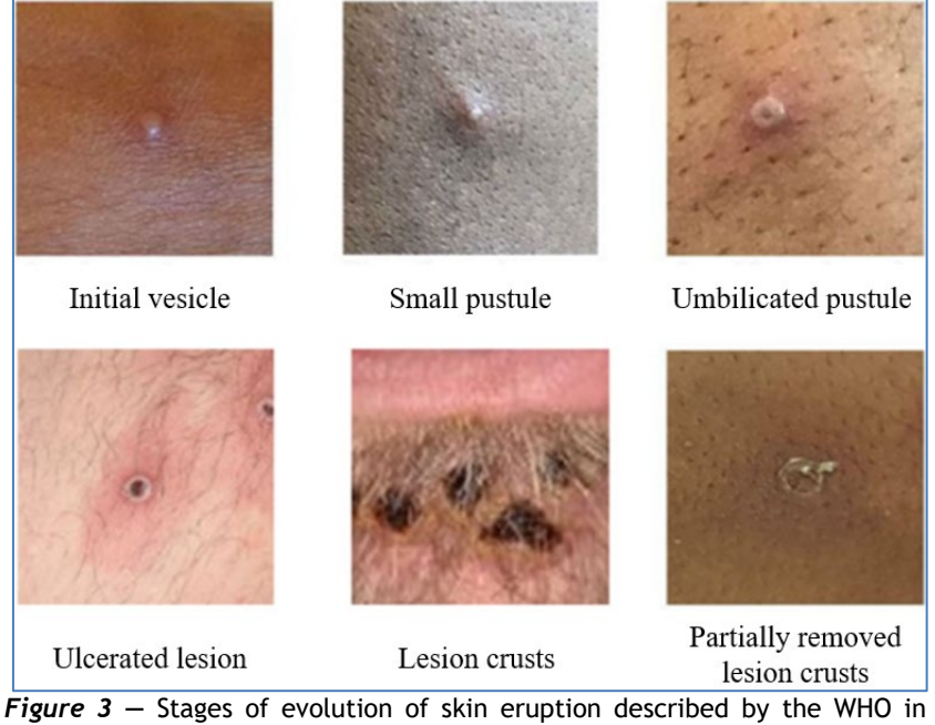
Figure 3 — Stages of evolution of skin eruption described by the WHO in patients affected by Mpox, starting as a vesicle, with pustular evolution, until the formation of crusts<sup>46</sup>.

Lethality varies between 1% and 10% according to host factors, access to care, intervention, and early support in cases of complications. A study of 282 cases identified no deaths among individuals who received smallpox vaccinations, with a 11% death rate among nonvaccinated individuals<sup>49</sup>. In a recent study with 23 individuals with a confirmed diagnosis of Mpox, no deaths were identified, only complications that included one epiglottitis and two myocarditis<sup>2</sup>.